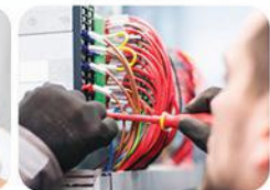
Small Electrical Parts Assembly Work